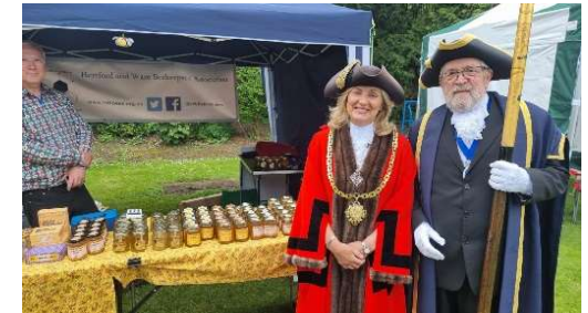
The Mayor visits us at the Jubilee Event

Public Engagement: We aim to engage with the public to share our enthusiasm for bees, and to promote their importance to the environment. In 2022, we took part in two very successful public events; in June we attended the Queen's Platinum Jubilee event at Hertford Castle and in July we attended the Ware Festival, back for the first time since 2019. In addition to selling honey, we had colouring activities for children and an observation hive of live bees, which was very effective at drawing people in to initiate bee chat. The events were very well attended and we had lots of interesting conversations with people interested in bees and the environment. In November we were at the Hertford Christmas Gala for the first time, a very busy event on a dark and chilly evening.