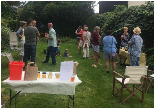
Garden Party...blind honey tasting in foreground