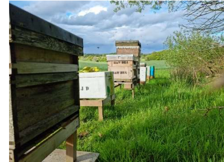
Hives at Essendon apiary

Our existing site near Hertford Heath remains in use for Members who need a space to keep bees away from home.