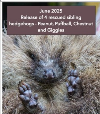
June 2025 Release of 4 rescued sibling hedgehogs - Peanut, Puffball, Chestnut and Giggles