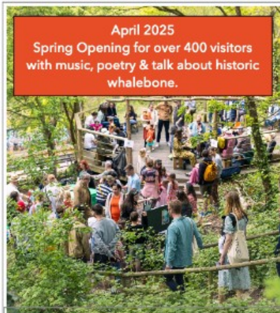
April 2025 Spring Opening for over 400 visitors with music, poetry & talk about historic whalebone.