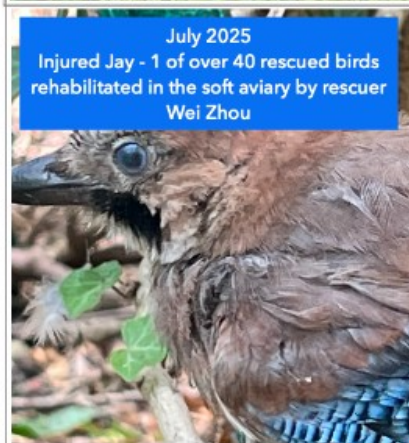
July 2025 Injured Jay - 1 of over 40 rescued birds rehabilitated in the soft aviary by rescuer Wei Zhou