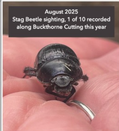
August 2025 Stag Beetle sighting, 1 of 10 recorded along Buckthorne Cutting this year