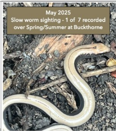
May 2025 Slow worm sighting - 1 of 7 recorded over Spring/Summer at Buckthorne