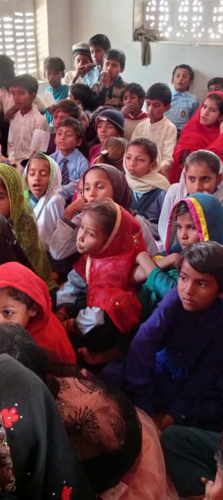
IMAGE: CHILDREN IN THE THAR DESERT AT NEW HOPE PUBLIC SCHOOL