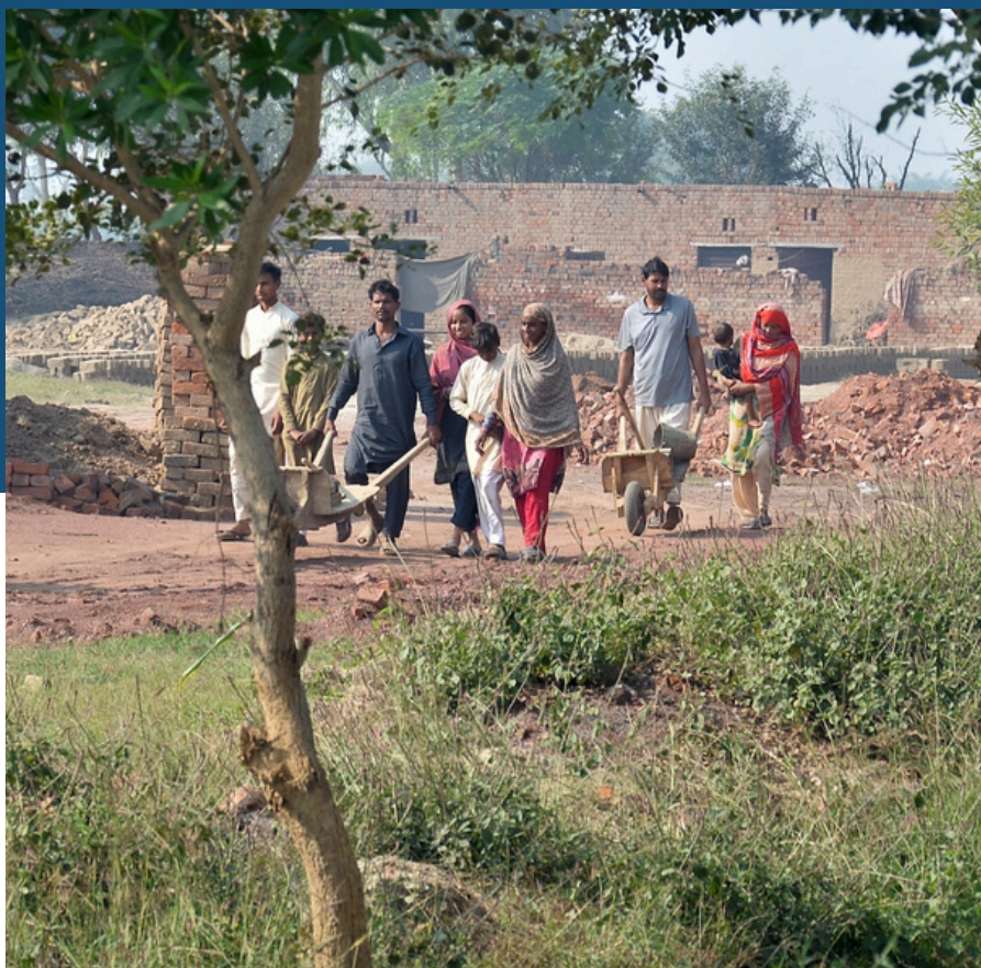
IMAGE: FAMILIES ENSLAVED IN THE BRICK KILNS OF PAKISTAN ARE FINALLY WALKING TO FREEDOM