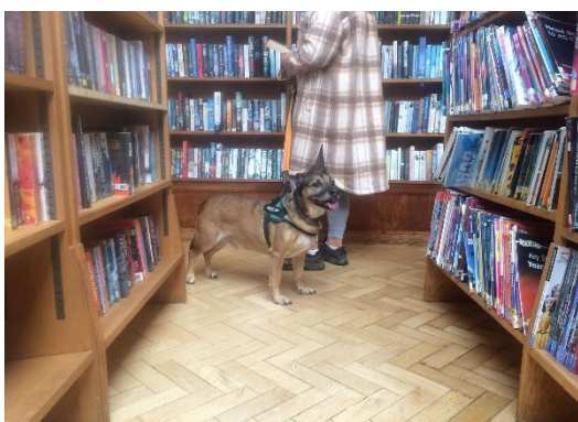
LIBRARY USER REFERENCING BOOKS