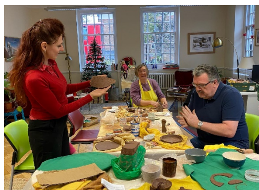
CLAY CRAFT AT CHRISTMAS