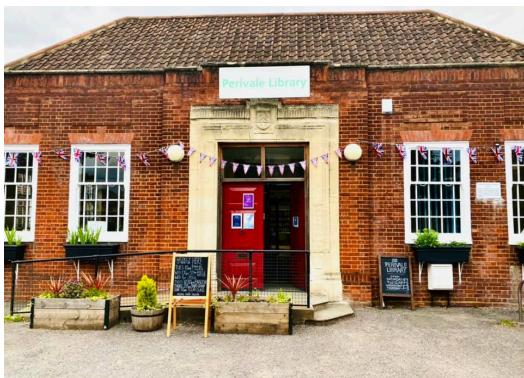
PERIVALE LIBRARY FROM THE OUTSIDE