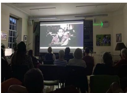
PERIVALE FILM CLUB SCREENING