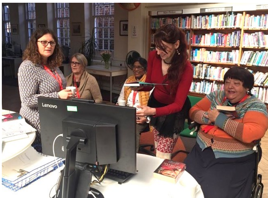
BELOW – PCH TRUSTEE TRAINING VOLUNTEERS