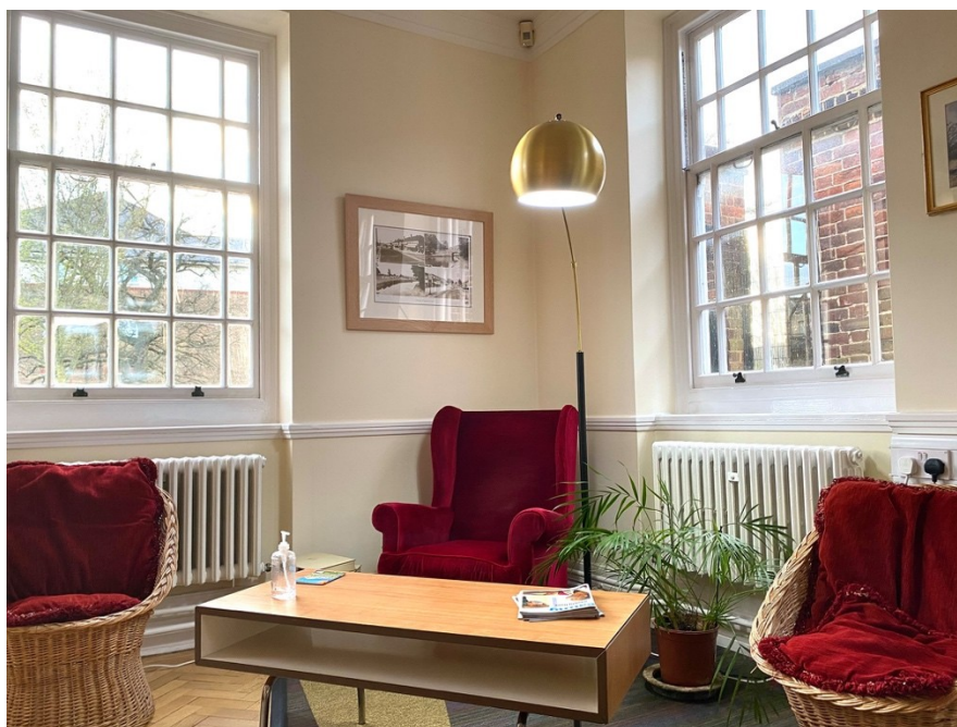
ABOVE – PART OF THE “LIVING ROOM” SPACE IN THE LIBRARY CREATED BY PCH