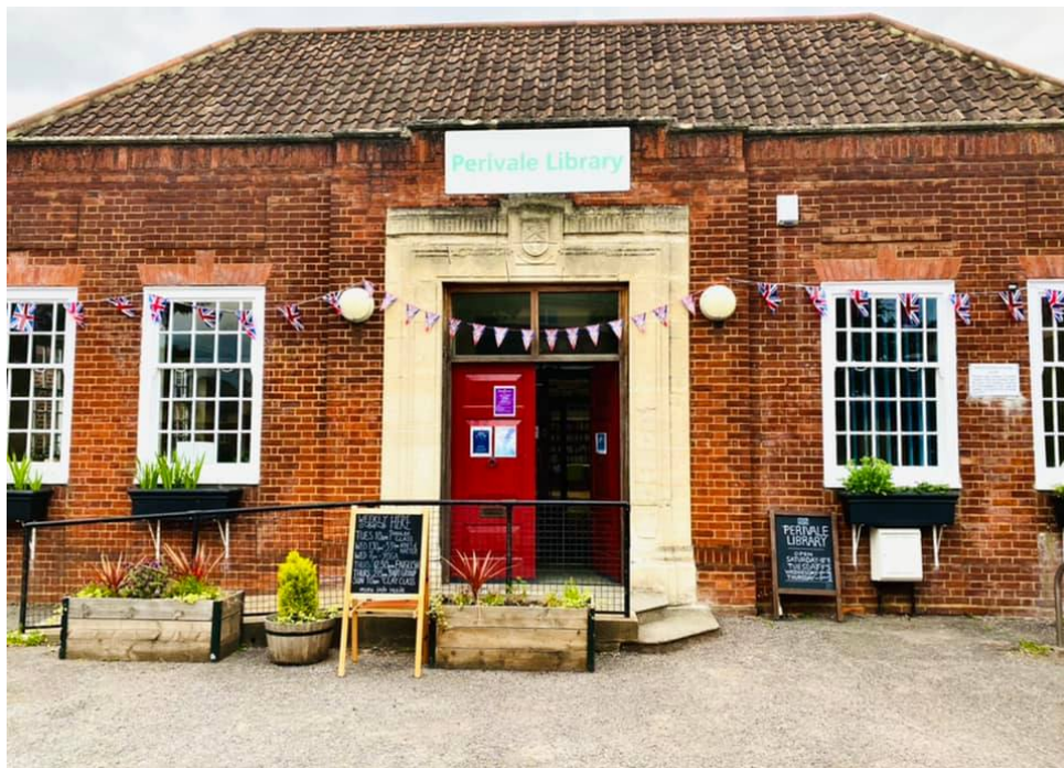
ABOVE – PERIVALE LIBRARY FROM THE OUTSIDE