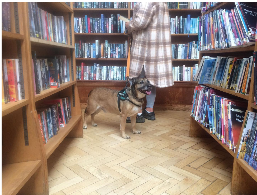
ABOVE - LIBRARY USER REFERENCING BOOKS