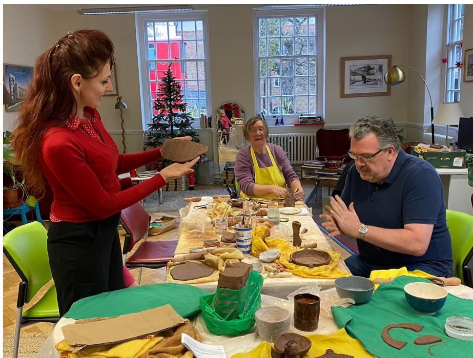
BELOW – CLAY CRAFT AT CHRISTMAS