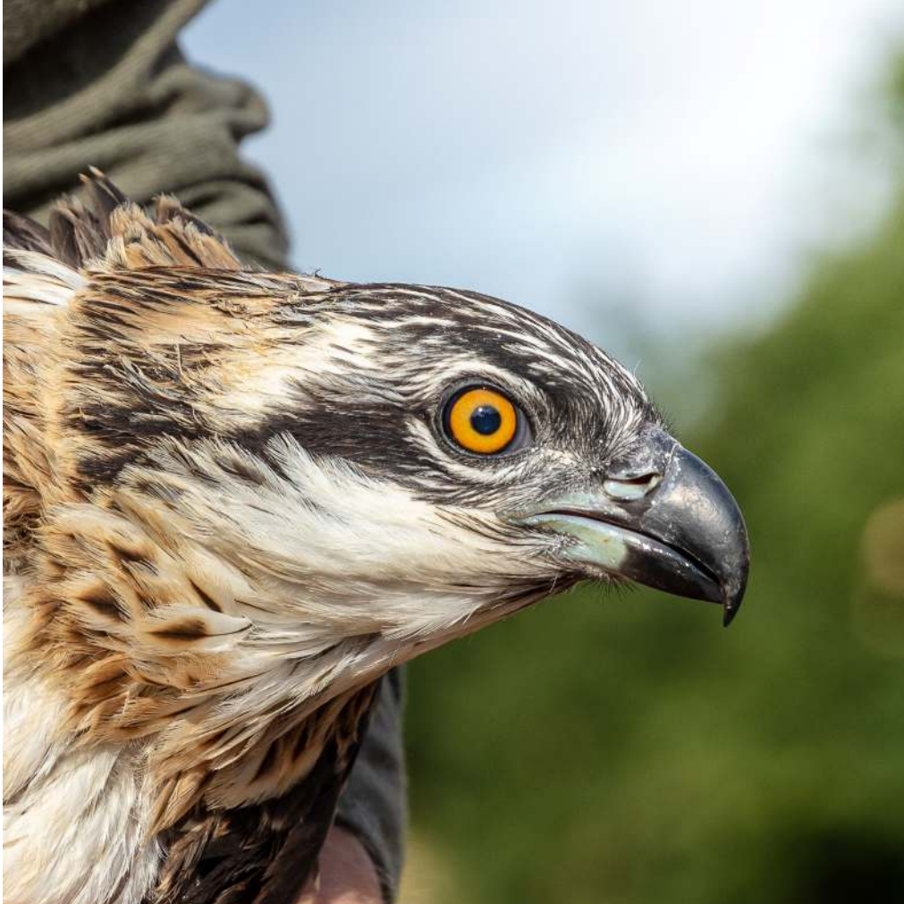
4K is an Osprey from Rutland Water who has been fitted with satellite tracking device which allows us to follow his journey

Sharing the stories of the tagged Ospreys migration – both good and bad – has driven a lot of traffic to our socials. Live videos have also proven popular alongside updates from the team and the environmental impacts they are documenting.