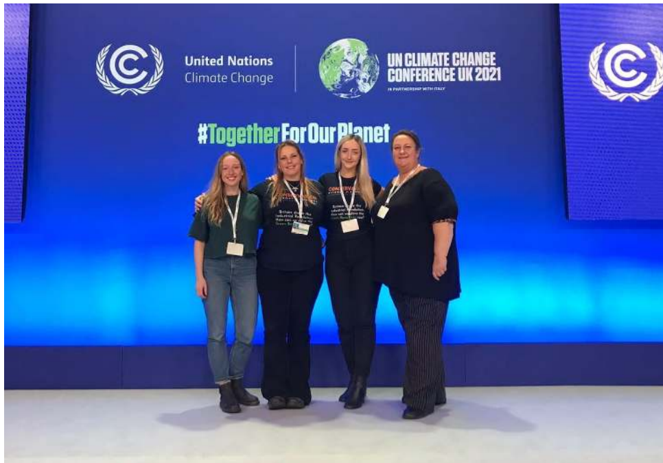
The CWB team at COP26

Inspired by the imagination of the venture the ITV production company, Wingspan Productions joined the expedition at key points to film an ITV documentary, fronted by Joanna Lumley which was shown on primetime TV in the first week of COP26 conference.