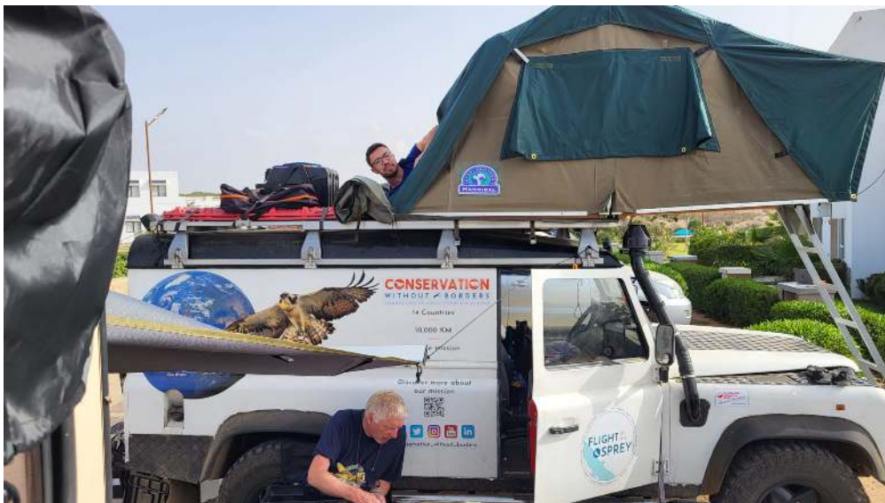
One of the branded FOTO vehicles in Morocco

The expedition is taking place overland in three LandRover vehicles which are branded with FOTO logos and have already provided a talking point. A Moroccan TV station spotted the vehicles and this resulted in Sacha being interviewed for the national TV station.