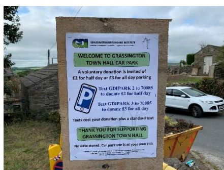
Fig. 3. Notices for the new voluntary donation scheme for the Town Hall car park appeared in August 2021, after a working party of Caretakers, Trustees and volunteers had removed all of the low-hanging branches from the boundary areas. This was a 12 months' scheme, operated by GDI with permission from Grassington Parish Council. All proceeds go to GDI for the upkeep of the building.

Following discussion with and permission of Grassington Parish Council, in August, GDI launched a voluntary donation scheme for parking at the Town Hall car park on Moor Lane. The scheme was based, initially, on donations made via mobile phone to a text number, provided by 'DonR'. This initiative provided some welcome additional funds to support the repair and improvement plans during the year.