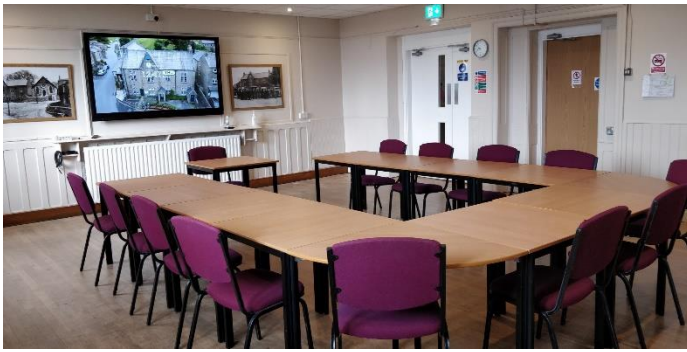
Fig 1 shows the newly-refurbished 'Jackson Room', complete with its giant, wifi-enabled, inter-active screen. The room is set out in a format which works well for formal meetings and educational sessions, but it retains its flexibility for its regular users.

Whilst sounding perverse, covid was a God-send for the charity as Government grants and the furlough scheme continued into 2021 to ensure the Town Hall remained afloat financially. Trustees and the small team of volunteers continued to work on a range of schemes and planning consent was received to develop a new Caretaker's Flat in the space previously occupied by the Dales Playschool. Having submitted a bid for funding, we were thrilled to receive £20,000, from the 'Power to Change' fund, to make good the shortfall in the Jackson Room development, develop the Caretaker's Flat and contribute something towards the design and re-development of the front ground floor elevation of the building.