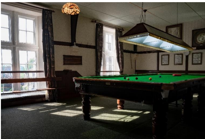
Fig 2 shows the new 'Tiffany-style' lighting and new curtains in the Snooker Room. All the pre-existing clutter has been removed and the room now offers 'Crucible-like' facilities for those who enjoy the game!

Receipt of this significant grant allowed the Trustees to assign funds to a small improvement to the Snooker Room, in which new lighting and curtains have been installed, a new loft ladder introduced in the clock room above, for safety reasons and an allowance to be made for new floor coverings in due course. The return to a 1930's style room may well make us more attractive to the 'All Creatures...' team, should they return to Grassington to film a future series!