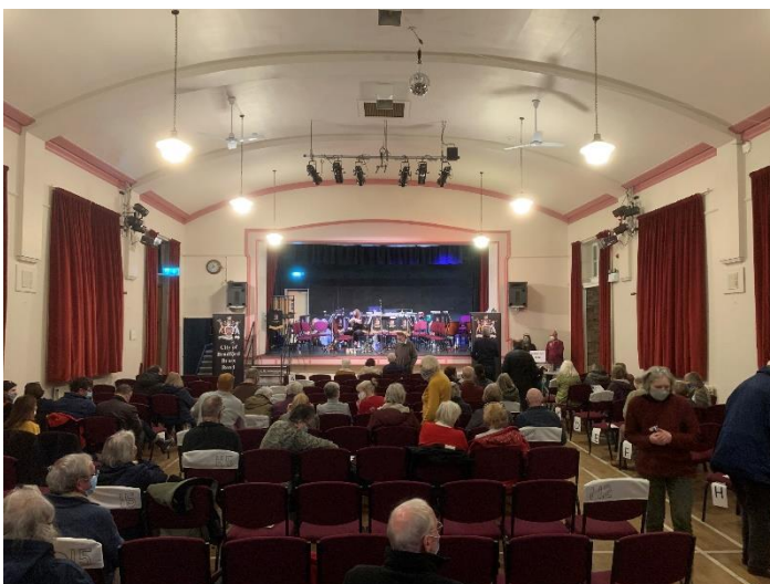
Fig 4 shows the Main Hall filling up for our biggest GDI-organised event of the year – the Christmas Concert by the City of Bradford Brass Band, held on 19 th December. Covid regulations were in place but the 100+ people attending all enjoyed the show.

Our largest, GDI-organised event of 2021 was the Christmas Concert by the City of Bradford Brass Band. The concert was held in accordance with covid guidelines, which required the audience and volunteers to wear face coverings throughout their time in the building. Despite this, a good audience attended for what has become a staple event in our calendar, raising valuable funds for the charity.