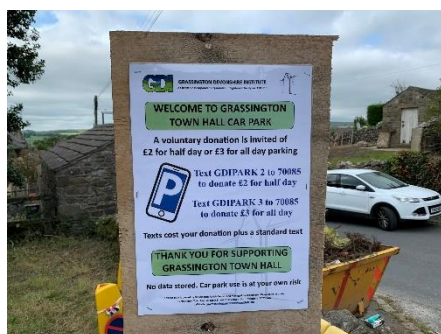
Fig. 3. Notices for the new voluntary donation scheme for the Town Hall car park appeared in August 2021, after a working party of Caretakers, Trustees and volunteers had removed all of the low-hanging branches from the boundary areas. This was a 12 months' scheme, operated by GDI with permission from Grassington Parish Council. All proceeds go to GDI for the upkeep of the building.

Following discussion with and permission of Grassington Parish Council, in August, GDI launched a voluntary donation scheme for parking at the Town Hall car park on Moor Lane. The scheme was based, initially, on donations made via mobile phone to a text number, provided by 'DonR'. This initiative provided some welcome additional funds to support the repair and improvement plans during the year.