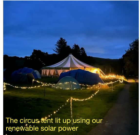
The circus tent lit up using our renewable solar power

Willow Globe regulars the Everyman Youth Theatre from Cardiff were here on Sunday 6th August with two performances of a magical and powerful interpretation of 'Macbeth'.