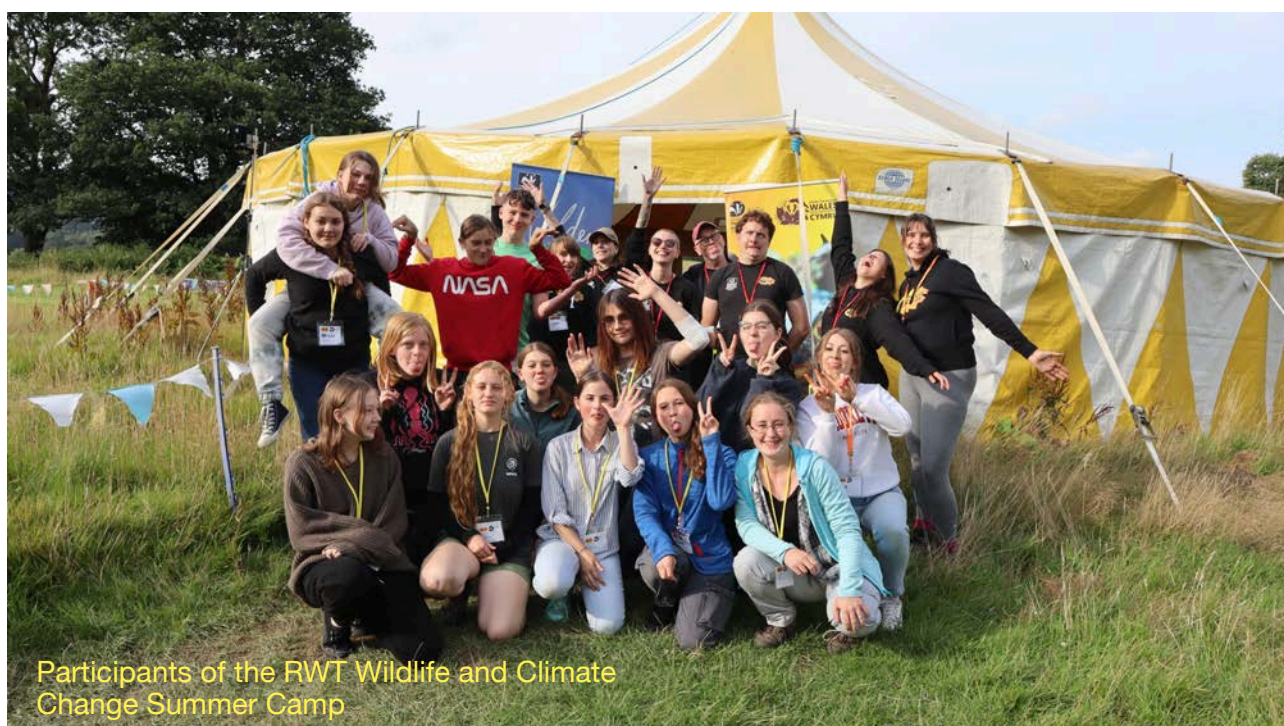
Participants of the RWT Wildlife and Climate Change Summer Camp

From 31st July to 4th August, the site was filled with young nature enthusiasts who came here for the Wildlife and Climate Change Summer Camp led by Radnorshire and Montgomery Wildlife Trusts . With outdoor activities, campaigns workshops, creative writing and improvisation workshops, the camp provided around twenty 14-18 year olds with a safe space to express their feelings and worries about nature and climate issues and to develop their skills and knowledge around them.