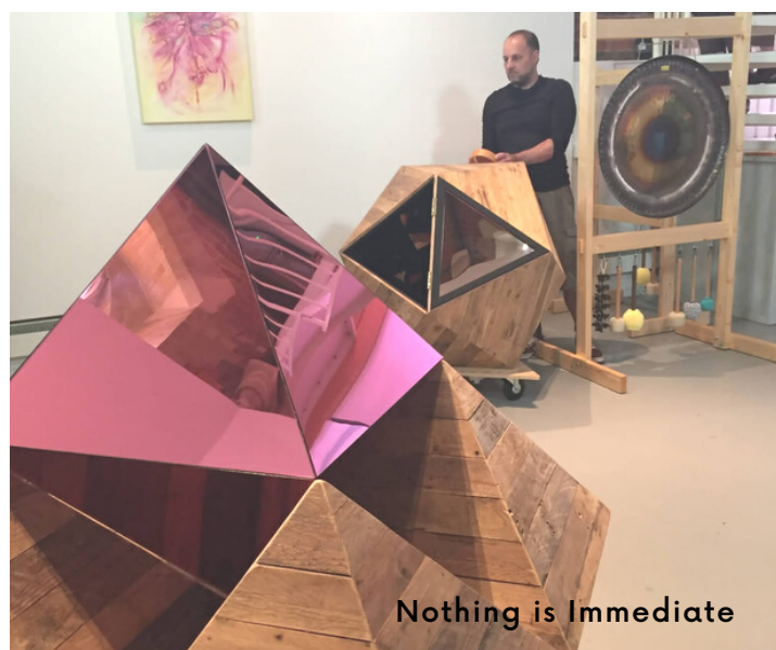
Nothing is Immediate