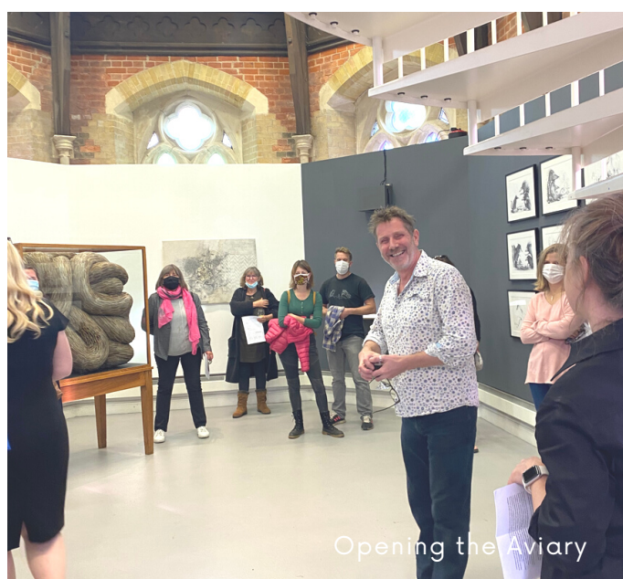
Opening the Aviary