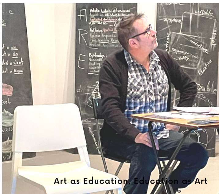
Art as Education, Education as Art