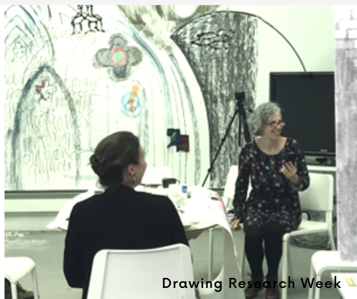
Drawing Research Week