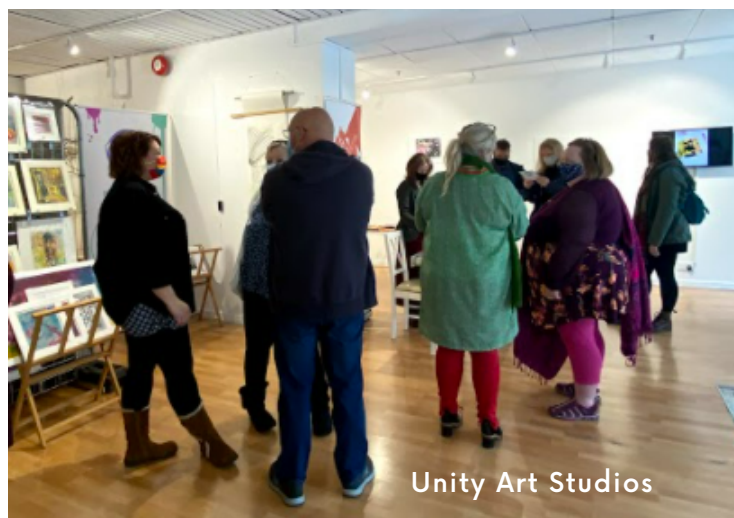
Unity Art Studios