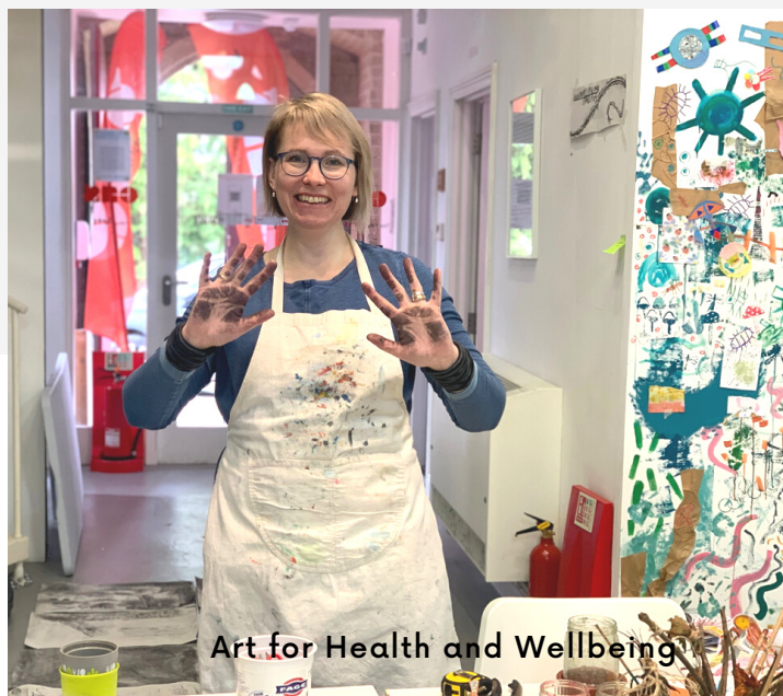
Art for Health and Wellbeing

The Symposium was a hybrid event with 32 people watching online and 8 participants in the Chapel.