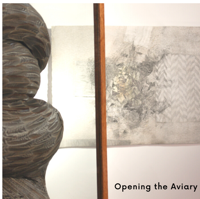
Opening the Aviary