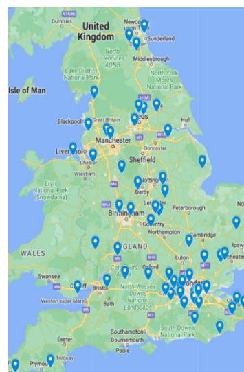
Locations of 2022/23 coordinators