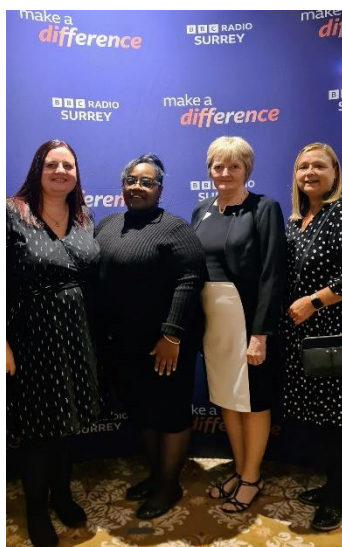
Our management team