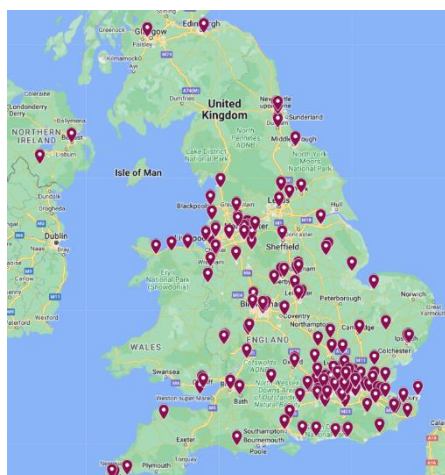
Locations of 2022/23 donations

In 2022/2023, we delivered 21,057 pairs of pyjamas, which was an increase of 9% compared to the previous year. This was the first time we have donated more than 20,000 pairs of pyjamas. Looking further back, we registered as a charity just four years ago and have seen an overall increase in donations of 333% versus 2018 (our last year before becoming a charity).