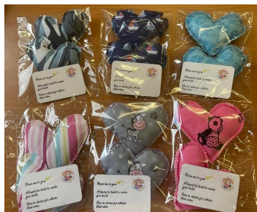
Hearts made by our volunteer sewing team