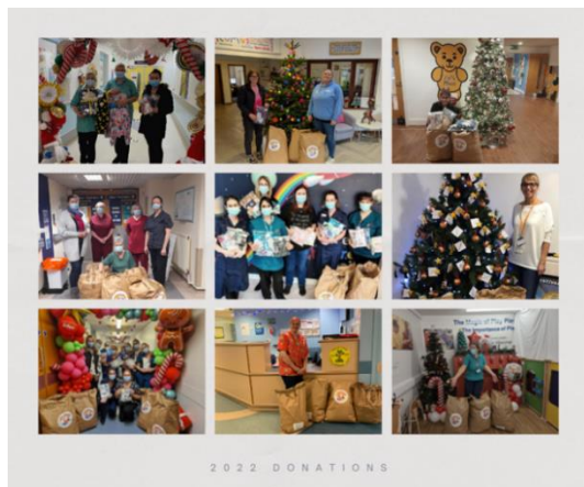
Some of our deliveries