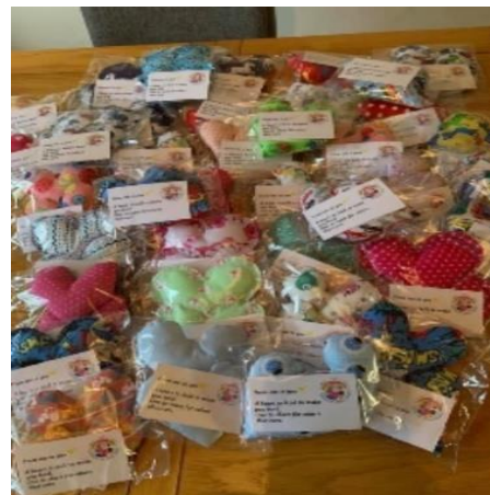
Hearts made by our volunteer sewing team