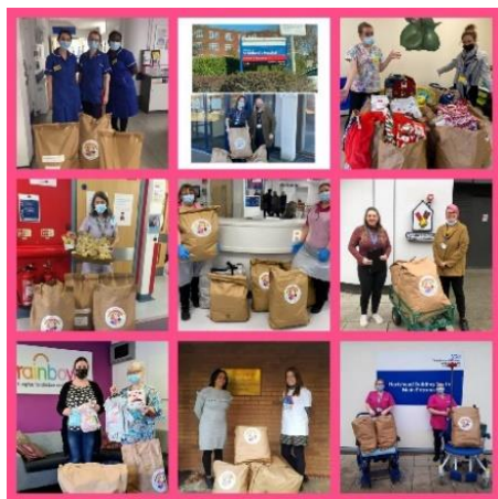
Some of our deliveries