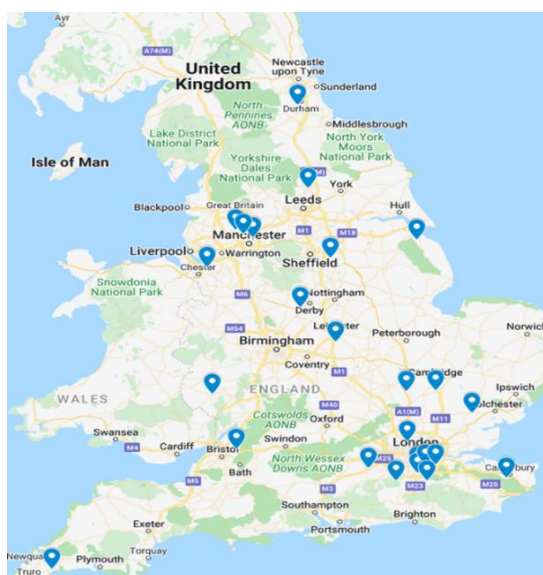
Locations of 2021/22 coordinators