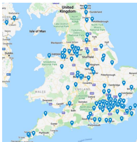
Locations of 2021/22 donations

In 2021/2022, we delivered 19,289 pairs of pyjamas, which was an increase of 23% compared to the previous year. This was very similar to the increase witnessed from 2019/2020 (28%). Looking further back, we registered as a charity in 2019 and have seen an overall increase in donations of almost 300% in this time.