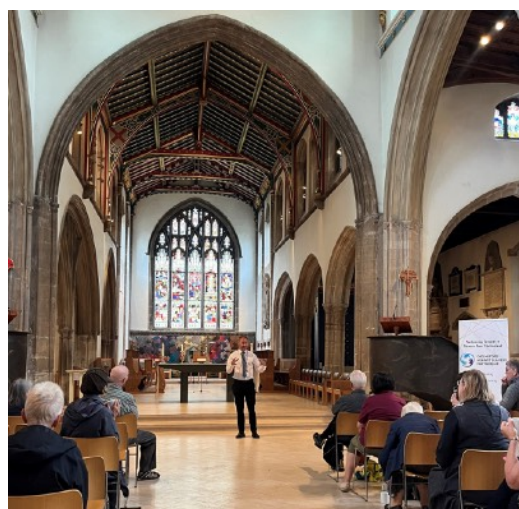
Training workshop at Chelmsford Cathedral