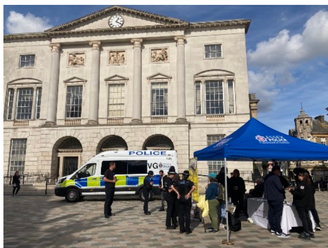
Awareness stall on Chelmsford High Street

TFF's part-time antislavery coordinator sits within Chelmsford Council and Police's Community Safety Hub to stimulate the development and objectives CASP. This is done alongside the Steering Group of ten representatives from Chelmsford Council, Police, Social Care and third sector. Ongoing work has been around CASP's three year strategy of: 1) developing an agile and dynamic partnership; 2) developing survivor care for victims of modern slavery and; 3) developing a well sustained and resourced partnership.