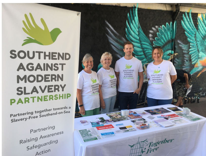
Above: World Day Against Trafficking, 30th July, stall and public engagement.