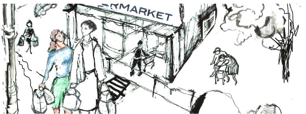
Community Based Survivor Care