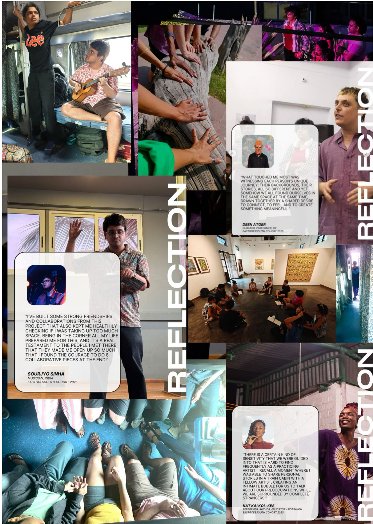
Selection of images and testimonials from EASTgoesSOUTH 2025