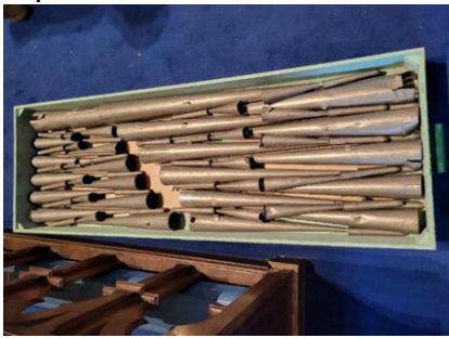
The restored metal flute (8ft rank) The completed front case. Note the silvered finish of pipe work

The works described above added considerably to the cost of the project. Around £18,000 for the new case work and internal/external ladders. £5300 for the extra electrical work/lighting. The new work also required amendments to the original specification of work/ Diocesan approval which delayed progress greatly. Consequently, the scaffolding was required for an additional 6 weeks, adding a further £2300 to the project costs.