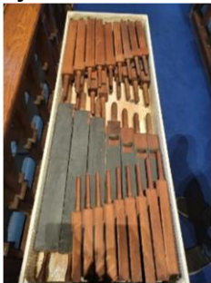
The 8ft stopped diapason pipes after restoration and cleaning