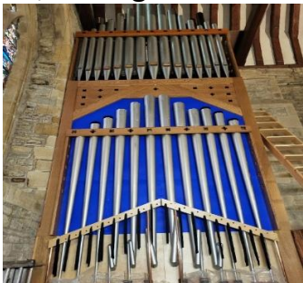
The beautiful new rear case, showing some of the 16ft trombone pipes and access ladder. The new rear case, showing the new exterior access ladder and top entrance