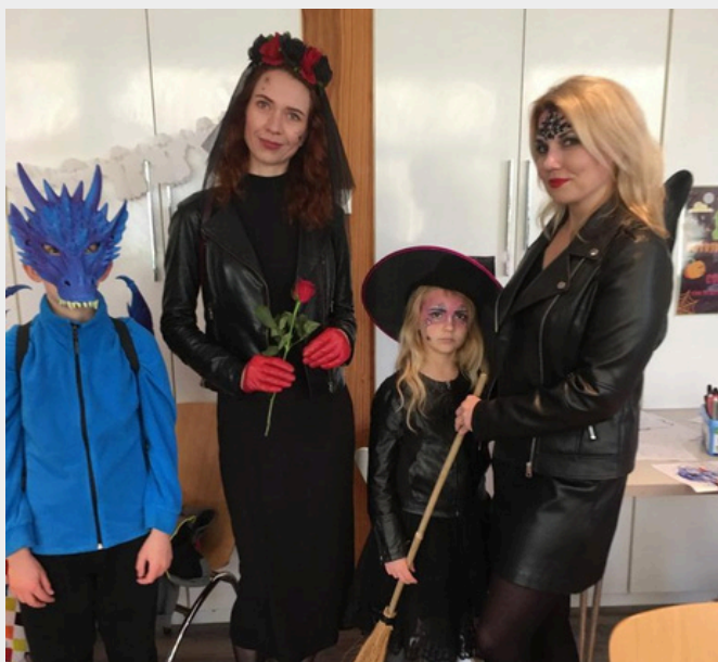
A spooky day – visit to Southend Museums for their fright night

Utilising our hub spaces we have sought to hold a number of events for our community and others to find out about our work and to meet with our members. We also seek to organise visits to local amenities and places of leisure so families can engage in the local area. This has included;