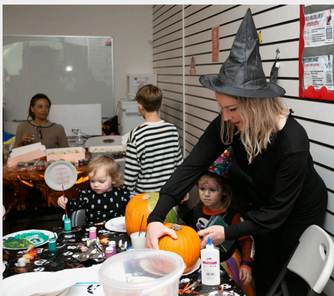
Pumpkin decoration thanks to Scott's of Southend.

Fundraising events at Halloween and over Christmas in Southend – the Southend hub is now also open Saturdays providing an opportunity for fundraising and volunteering for members who can find weekends isolating.