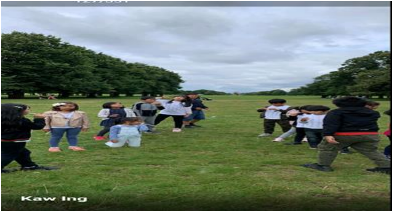
Photo: Summer Kachin literature students went out and played in Bushy Park at the last day of the school.