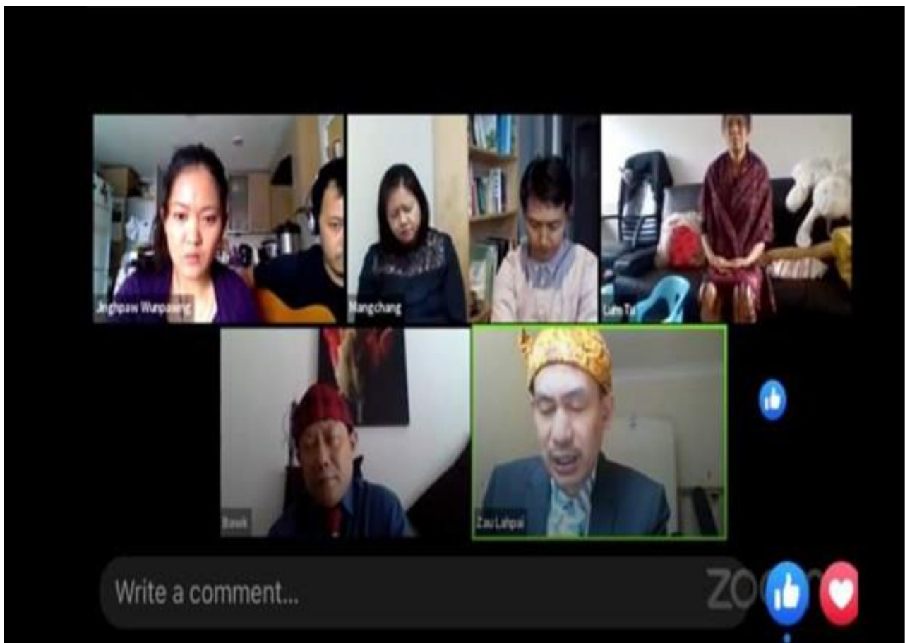
Photo: Online Sunday Worship Service.

As a Christian Church, believers gather and worship together at the church every Sunday. The Sunday mass worship service is held on every Sunday between 11 am to 12:30 pm. Around 50 church members attend regularly. The service is usually held in the church but during Covid 19 restrictions it was held online using zoom calls.