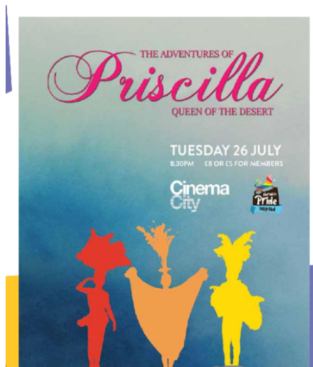
Image shows an advert for the film The Adventures of Priscilla Queen of the Desert at Cinema City on 26 July 2022 with three silhouetted drag queens in red, orange and yellow and the Norwich Pride Inspired logo

Over 20 events organised at local venues took place during July 2022 that were linked to Norwich Pride. This means there are even more ways for people to attend LGBTQIA+ events and engage with Norwich Pride in some way.