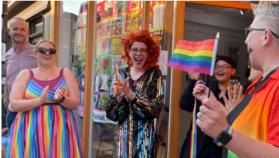
Opening of the Something Queer About This Art exhibition on St Augustines Street, for the 2021 Norwich Pride event.

Norwich Pride organisers are optimistic this year's celebrations will be more popular than ever despite the majority of events being streamed online.