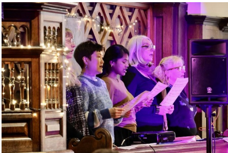
“Time for God” volunteer

The choir needs to continue to grow so that, even when numbers decline, as they always do through the year, the choir will still be a successful group taking non-musicians and reluctant musicians and welding them into a successful ensemble of enthusiastic and capable singers. There needs to be more marketing over the coming year, mostly online as this seems to be the most successful.