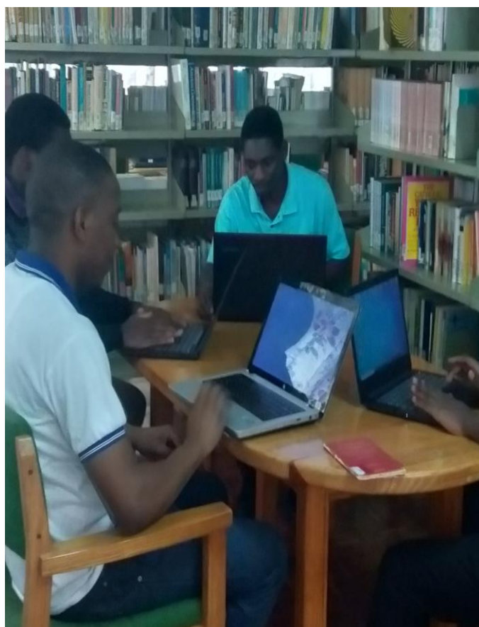
New computers have arrived for students in Ngong, Nairobi.