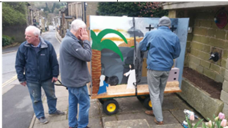
Members installing our Easter display in the Fox’s Head Well for The Pateley Bridge Town Council.