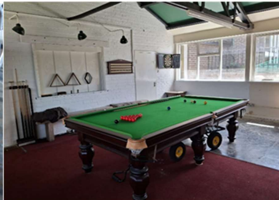
Resident's bench being prepared for repainting - and the new "social area" now in use