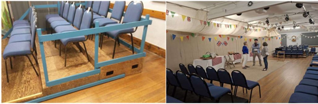
Scenery and the seating assembled for the Summerbridge Players production of “A Fete Worse Than Death” which some members helped to set up and take down.