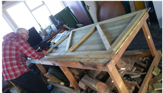
Before picture of our additional workshop space after tenant left, plus starting to use the cleared areas ...