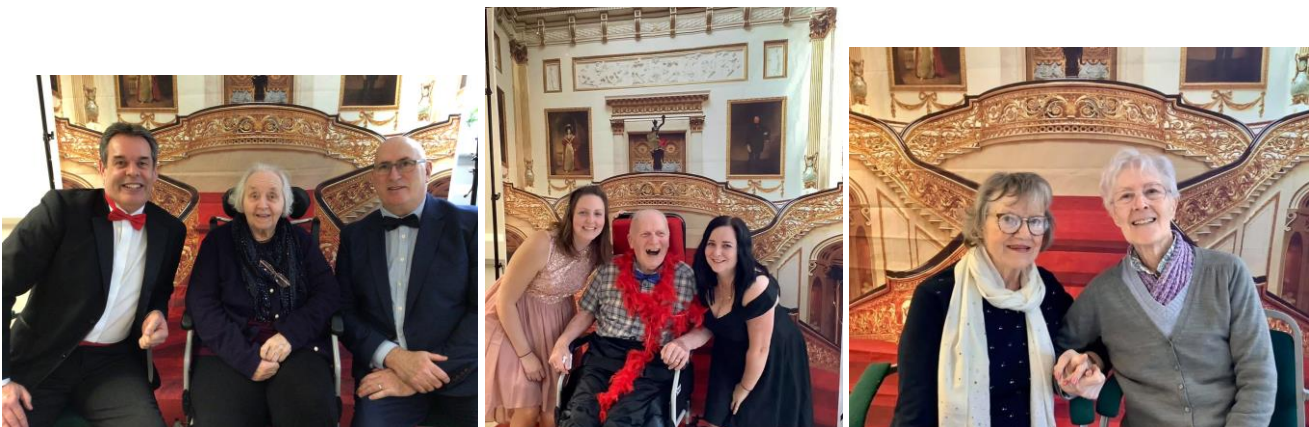
Going to a Ball

Some of the themes we chose: Musicals, Beach Holidays, 1950's, Movie Week, Disney Week, Going to a Ball. Service users and staff took delight in getting dressed up we had musical entertainment and the atmosphere was amazing!