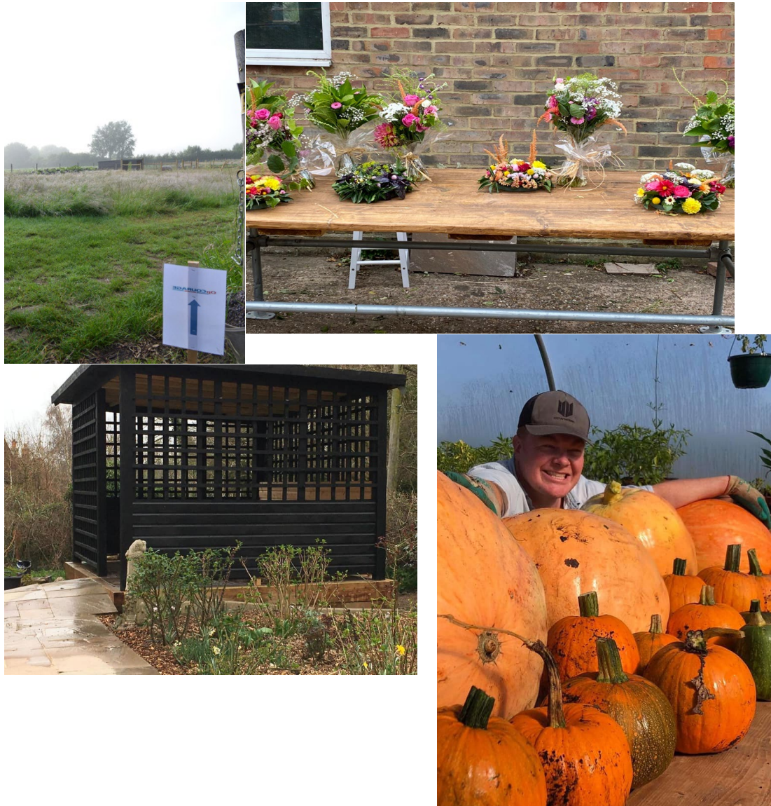
Top to bottom, L to R: A team-building day for NHS Operation Courage; Flowers arranged by veterans; A pavilion designed and built by one of our veterans; One of our veterans with the pumpkin harvest