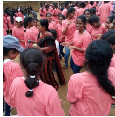
Boys and girls enjoying Children's Day wearing the T-shirts Brighter Path sponsored