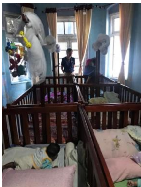
1. The newborn baby room at Sujatha Sewa Baby Home

In February 2024 we donated baby essentials including formula and nappies to the Sujatha Sewana babies home in Bandarawella. This facility is run by the State and looks after newborn babies and very young children who have either been given up at birth, abandoned or who cannot be looked after by their parents. The babies are well cared for but there is a chronic shortage of supplies.