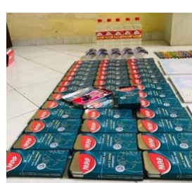
The stationery that was donated