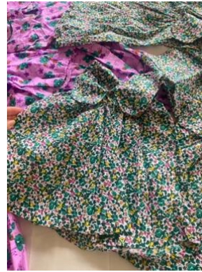
The Vishaka Training Centre sewing school which Brighter Path is supporting. Girls in the care system who can't attend mainstream school study vocational skills here.