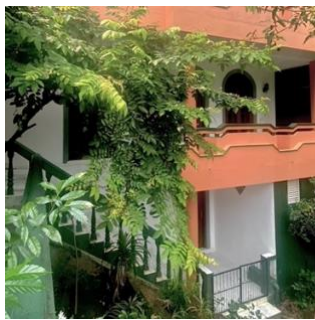
1. The Boys' new transition home

We also funded annual outings for the boys and girls. These young people rarely have an opportunity to celebrate. We funded a day out at Galle Face, Colombo for the girls with kite flying and pizza. For the boys they travelled for the day to Galle, went swimming in the sea and had a celebratory meal before visiting Galle Fort. Both occasions which might be routine for some young people were memorable events for our care leavers.