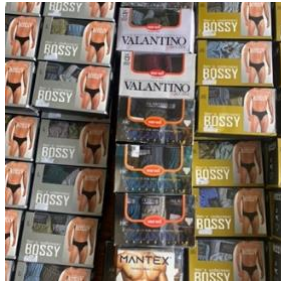
1. The underwear for boys and girls aged 2 to 18.

We donated 585 pairs of underpants to boys and girls in government children's homes in the Bandarawell area. Although these homes receive some state funding they rely heavily on private donations. There is a real shortage of underwear for children but most people are too embarrassed to talk about the issue. Some boys manage with a single pair of underpants but others do not have any at all. Our donation ensures that every child in these homes will have at least two pairs of pants.