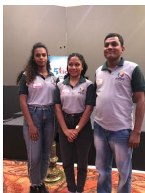
1. The three care leavers at the Biennial Conference.

Topics covered included the policy gaps so frequently encountered by care leavers: in financial security, housing, education, access to healthcare and in employment.