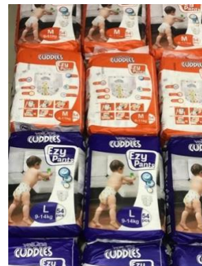
3. Some of the donations

1 st October 2023 was the United Nations National Children's Day. This is always a big day in Sri Lanka, particularly for children in care. The motto of the 2023 event was "For every child, every right". We sponsored T-shirts for all children in the care of Uva Province's probation department. A total of 564 children took part, aged from four to 18 and all wore the same colourful t-shirt. On this special day many children who are in different children's homes see siblings from other homes for the only time in the year.