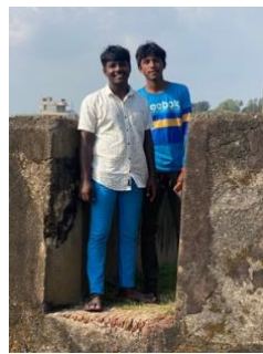
2. and 3. Boys trip to Galle and Unnawatuna