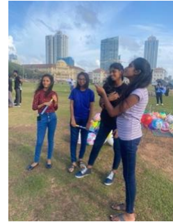
4. Girls' trip to Galle Face