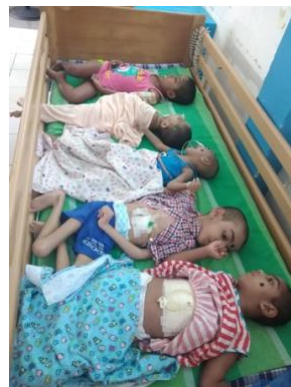
2. Young children at the Meth Sewa home.