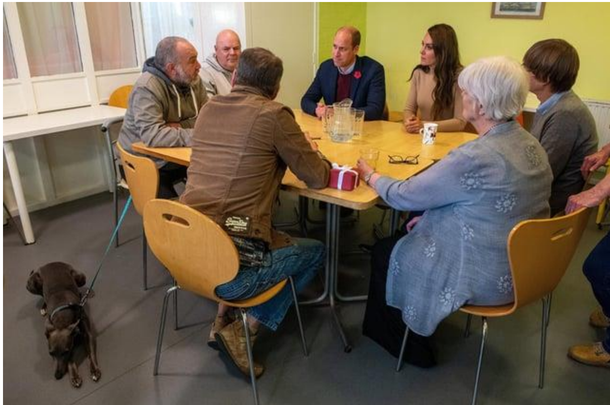
The Royal Visit.