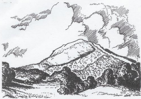
The Wickin from the North-East

"Atalaya", The Alley, Little Wenlock, Telford, Shropshire. TF6 5BG.