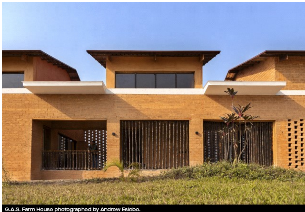
G.A.S. Farm House