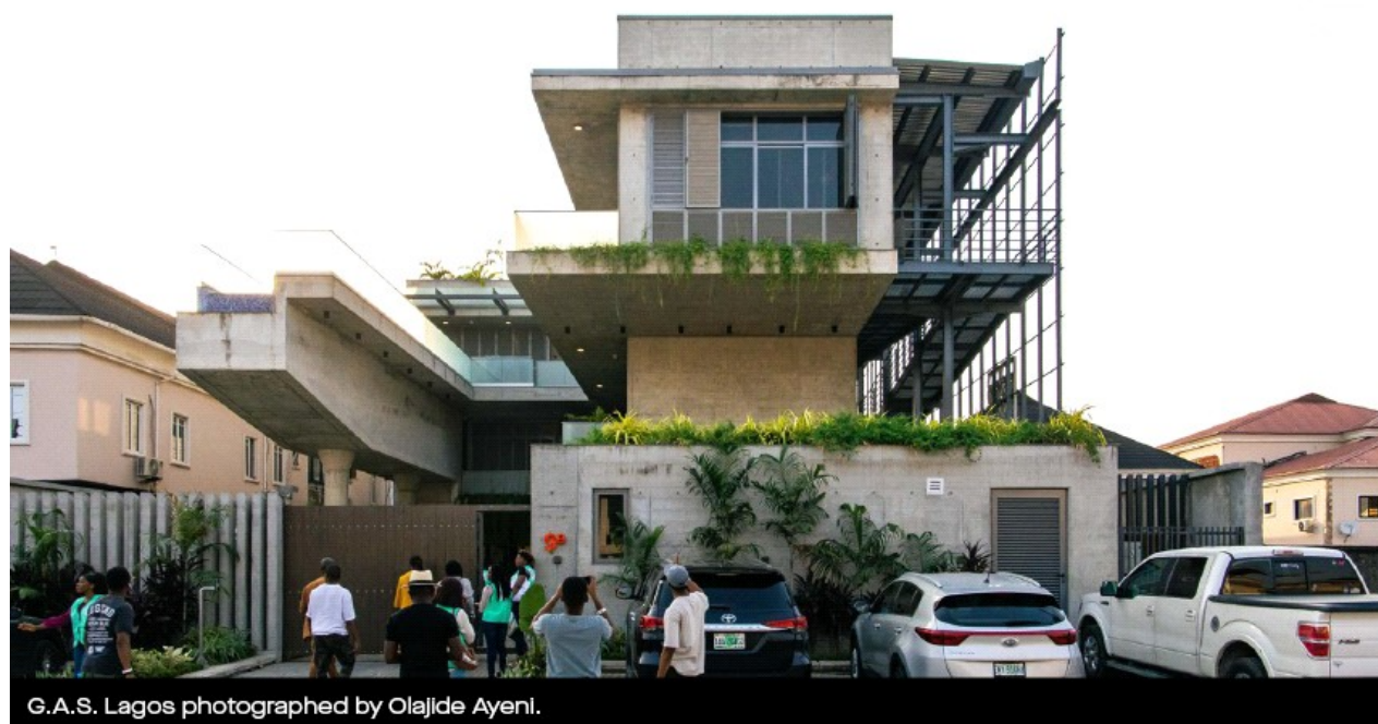
G.A.S. Lagos

Artists residencies programmed and developed by Y.S.F. and hosted by G.A.S. Foundation in Nigeria commenced in May 2022, please see plans for future periods section for details.