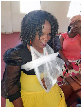
A teacher demonstrates a basic sling on a colleague