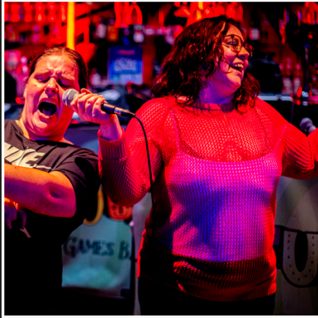
SoDaDa event at Funhouse