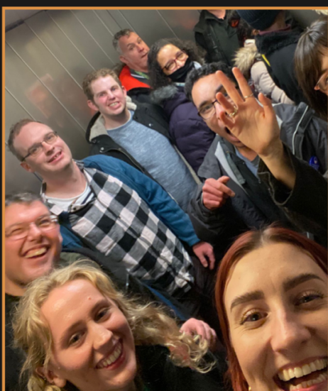
Gig buddies on their way to a gig in London

"It's like joining in with new friends and new people. Some of us know each other, some of us don't. The more we get to know each other the more we get to socialise and have fun. That is what it is about." Gig Buddies participant