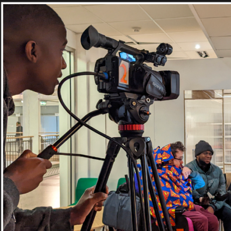
Media Team workshop