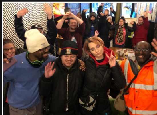
Leisure Link members celebrating together at one of the monthly socials