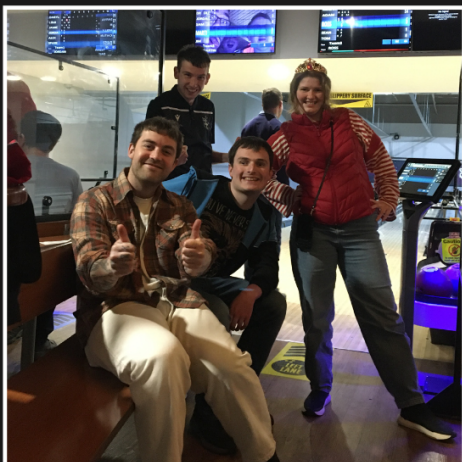
Gig buddies enjoying a bowling social