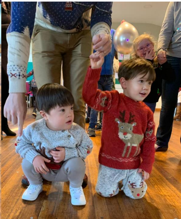
Bowling & Pizza Night