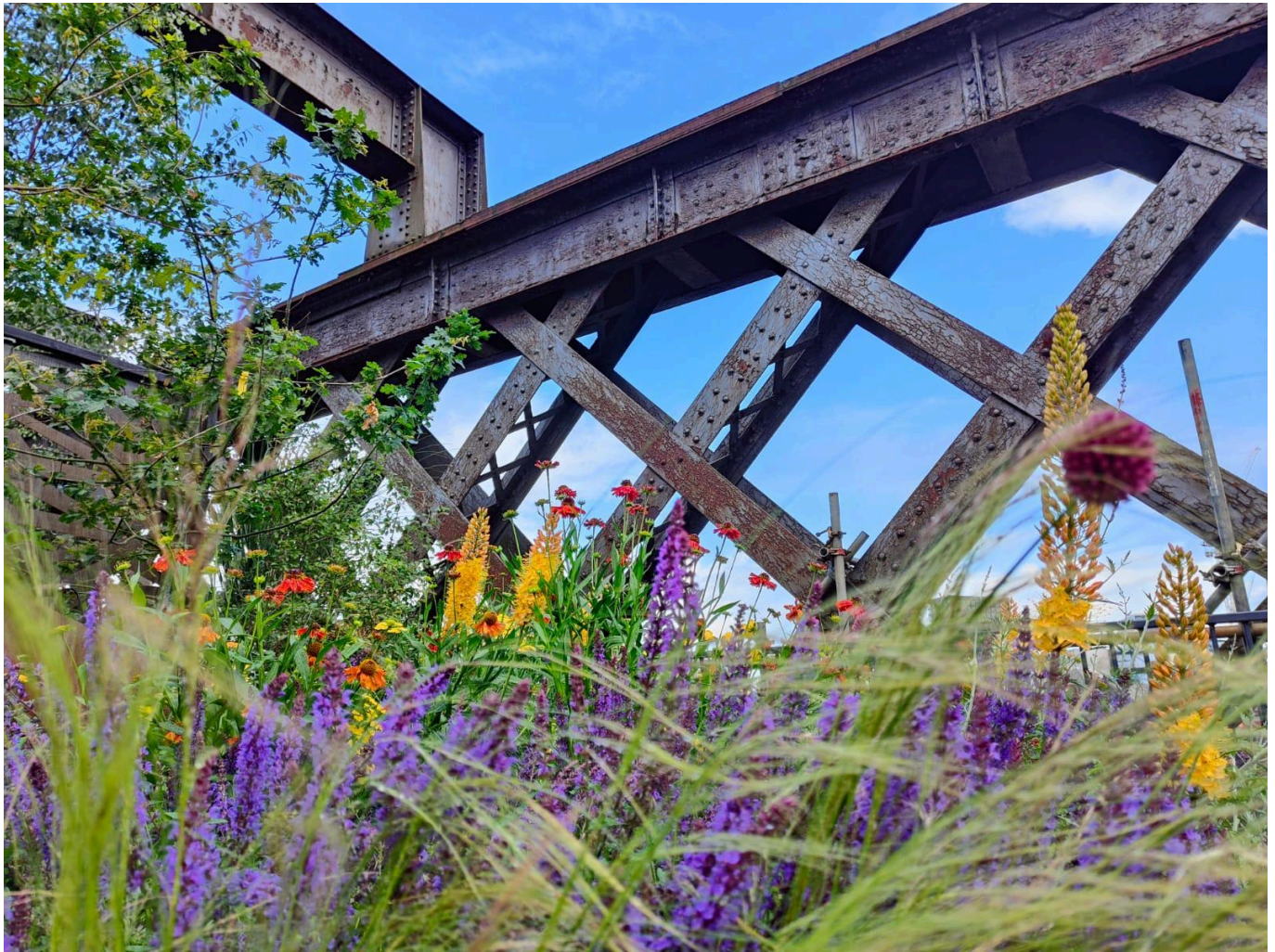
Castlefield Viaduct: our community plot.