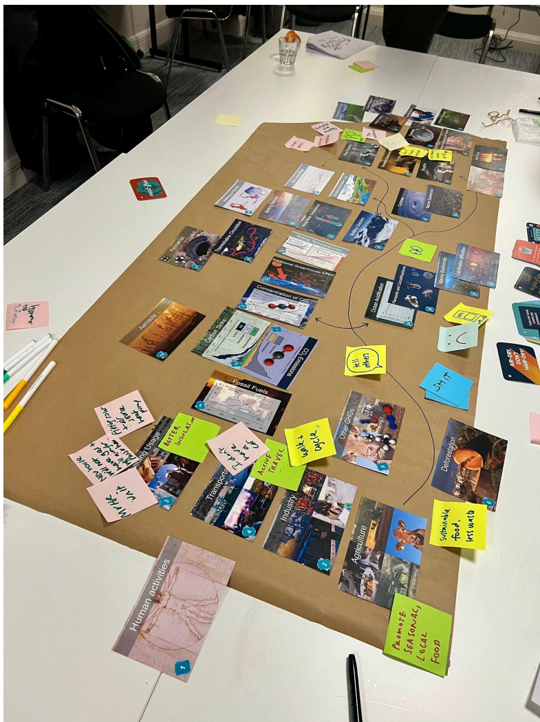
A Climate Fresk workshop, hosted at Castlefield Hotel

We recently hosted 2 'Climate Fresk' workshops to help drive more awareness but this is not enough: we need to drive more action at a local level. The Viaduct has the potential to drive more active travel but this is at least 18 months away and only scratches the surface.