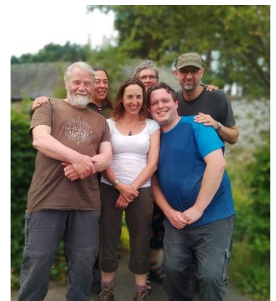
Heart Wood Facilitators, 2024

"I take my sister's dog for a walk, 3 or 4 times a week now ... My mind just switched off, but for some reason when I've come here, it's woken up ... All my family have noticed as well that I've changed ... And last week when I went to the doctors to see my doctor, even she said, she said "Ye what a difference."