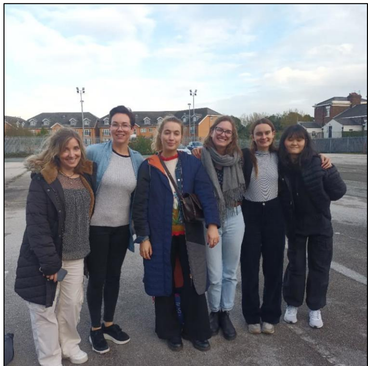
Volunteers on our Ambassadors program at HMP Liverpool, October 2023

"It was so lovely to be able to sing together in a relaxed area, the children loved singing with their uncle and playing the games. Everyone joined in, there was lots of laughter and the staff made it a special day."