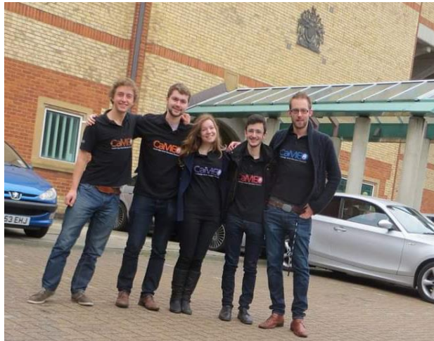
Throwback to Sing Inside's first singing workshop in prison, 10 years ago in 2014!

Our initial founding Trustees, having served two terms, will step down this year and we are fortunate to have recruited two new Trustees who have served on the Executive Team as founding volunteers of Sing Inside and bring a strong historical knowledge and understanding of the charity's growth. Our board has significant lived and professional experience in the criminal justice system and music education as well as charity finance, income generation, setting strategy and KPIs. This breadth of skills will help us meet our strategic goals and focus on generating core income to support staff costs.