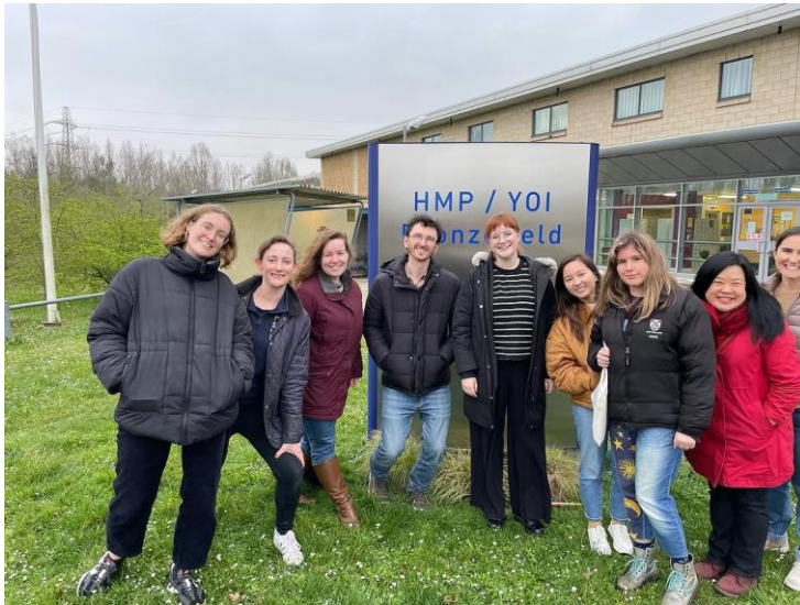
Volunteers at HMP Bronzefield, March 2024

The afternoon kicked off with a version of 'True Colours' by Cyndi Lauper and the strong women energy kept going with rousing and rowdy renditions of Aretha Franklin's 'Respect', and 'I Will Survive', by Gloria Gaynor, with an audience of invited women and guests singing along, clapping and generally enjoying some time to let loose (as much as is possible in a prison environment) and celebrate themselves and the other women who are taking a similar path as them.