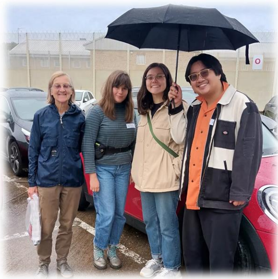
Volunteers at HMP SEND in Surrey, May 2023

about supporting our new staff team to continue embedding well into the organisation, bringing their own ideas for the charity moving forwards as well as recruiting new trustees to strengthen the Board as some Trustees will step away at the end of their terms.