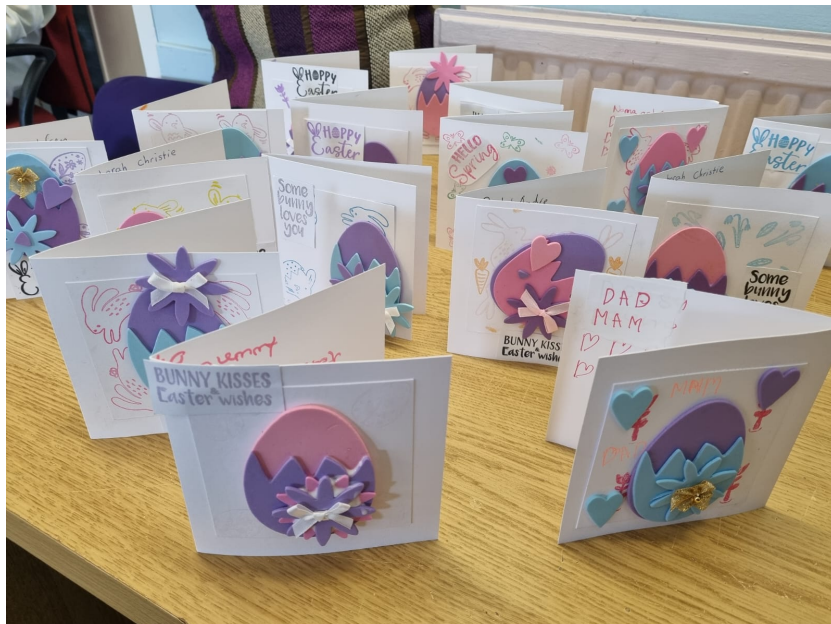
.Our Easter cards above