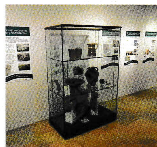
The Golden Jubilee Exhibition at Lincoln Museum.