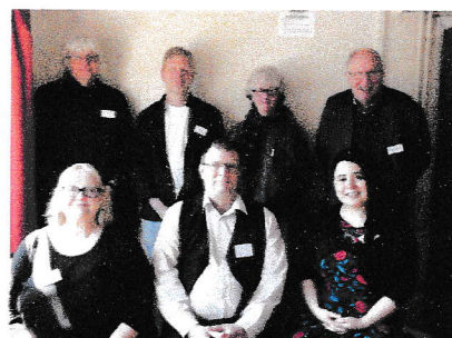
Speakers at the 'Lincolnshire Reimagined Conference' held at Welton Village Hall.