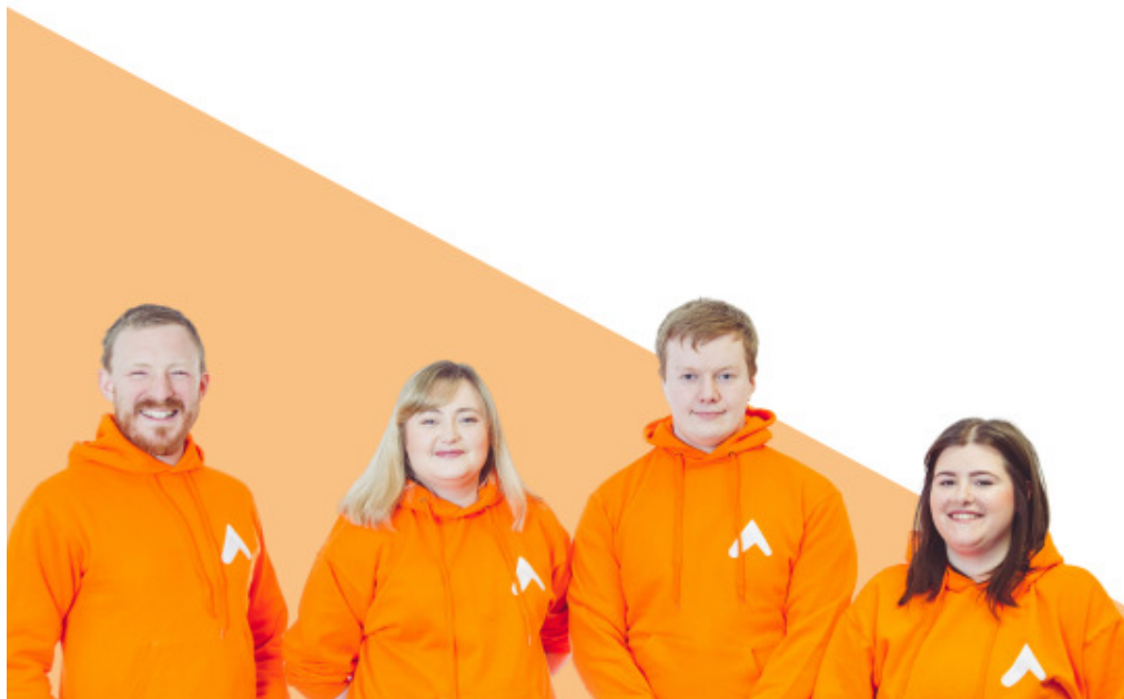
The Altitude Foundation Team

New trustees undergo an induction to brief them on their legal obligations under charity law, the Charity Commission guidance on public benefit, content of the constitution, the board of trustees and the decision making processes, the business plan and recent financial performance of the charity. During the induction they meet key employees and other trustees. Trustees are encouraged to attend appropriate external training events where these will facilitate the undertaking of their role.