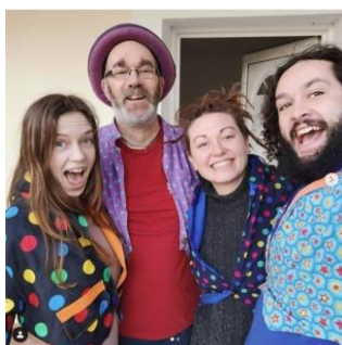
Team Greece 2019