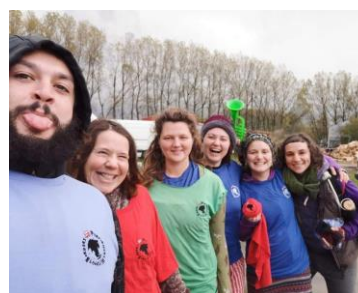
Calais and Dunkirk 2019