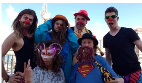
Team Kenya 2020