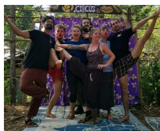
Team India 2020