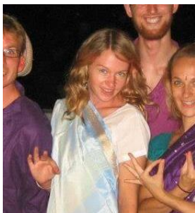
Abi India 2013