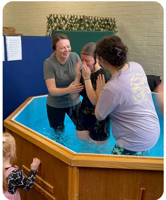
One young person being baptised by Blank Canvas team members in a local church.

Following the completion of Alpha in the winter, Sunday Night Live was launched in January to provide a space for young people to eat together and explore the Christian faith in creative and meaningful ways.