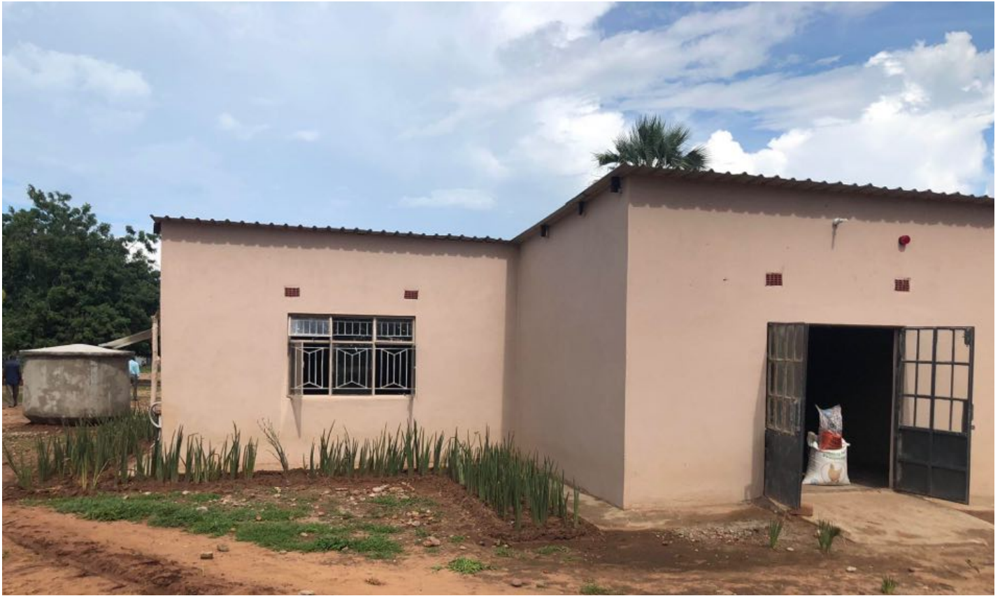
Photo: Kariba South Primary's solar-run Agricultural Hub Shop with rainwater harvesting demonstration system