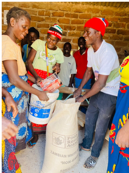
Photo: maize grinding service inside the Agricultural Hub shop