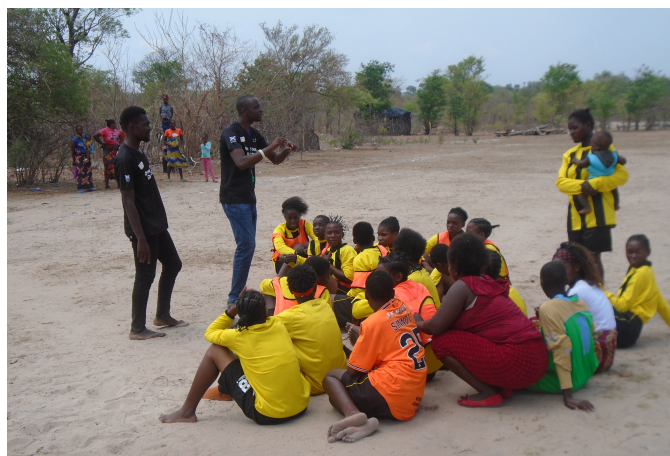
Photo: some of the girls in football kit that was generously donated by Kit Aid

Covid19 restrictions meant that some of our activities were delayed due to restrictions on large gatherings, however we managed to adapt the league and still be on track to finish all activities by the end of March 2022 for the end of the first year of the project. In year two of the project we are looking forward to involving more men and husbands into strategies to return young girls and women to school, as this was the biggest barrier to our success in the first year.