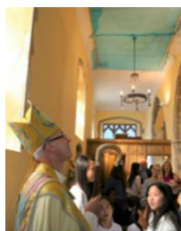
The Archbishop inspects the ceiling in 2017.

At the end of June, we finally signed off the National Lottery Heritage Fund Project. This had begun in 2017 when the Quinquennial Inspection had identified the need for major repairs to Sturry Church. With funding from the NLHF, donations from individuals, fundraising activities and volunteers time valued at £27,000, we delivered a £317,000 project. Along the way we had COVID lockdowns, a liquidated main contractor and three church treasurers. However, the building was repaired, kitchen facilities were improved and we became able to share the building and its heritage with the wider community.