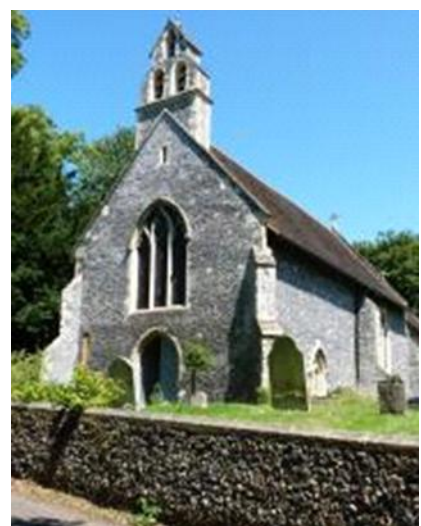
All Saints Westbere