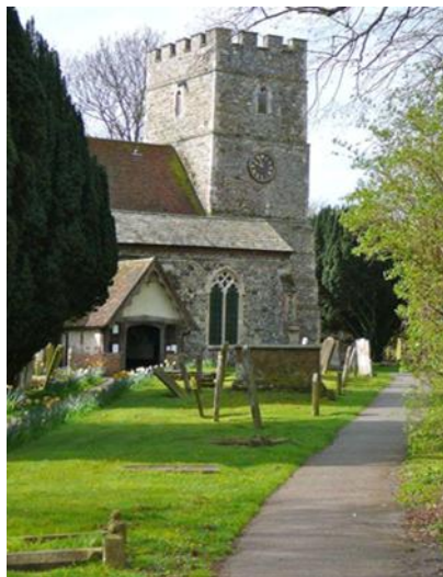
St. Nicholas' Sturry