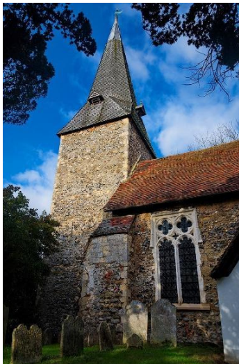
St Mary Fordwich