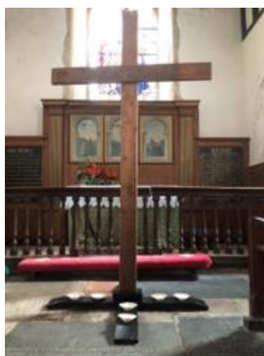
Pilgrim Cross made and Blessed in 2023 Fordwich Church