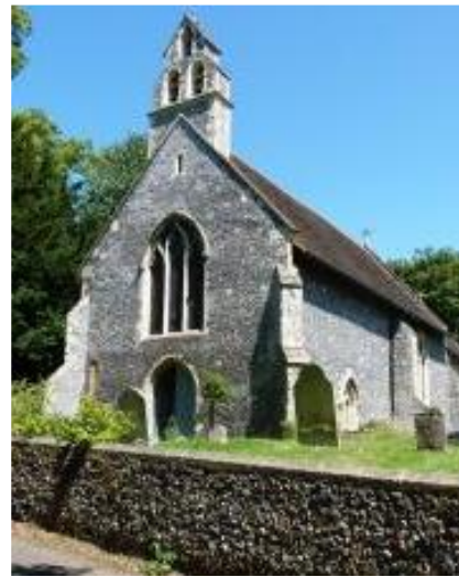
All Saints Westbere