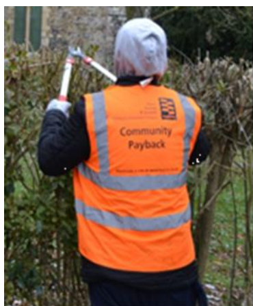
Community Payback at work in the Sturry Churchyard.

For some years, the church has worked with Community Payback. Community Payback is the scheme under which offenders carry out unpaid work in the community instead of undergoing a custodial sentence. Most Sundays, a team of between 10 and 20 offenders and their supervisors can be seen working in the churchyard and the Milner Ground. The Milner Ground is the land between the churchyard and the A28 road which the church holds on trust for the community. Since we brokered the relationship with CP, they have been working on projects for other organisations in our villages, including Sturry Parish Council and the Scouts. Also, most Sundays the congregation and the offenders share in the after-service tea, coffee and biscuits. We hope this shows that we are a welcoming and accepting body.