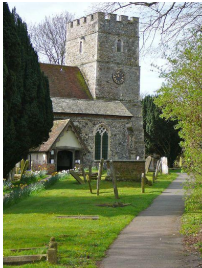
St Nicholas Sturry