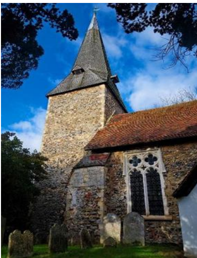
St. Mary's Fordwich