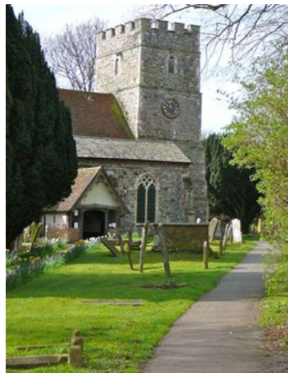
St. Nicholas' Sturry