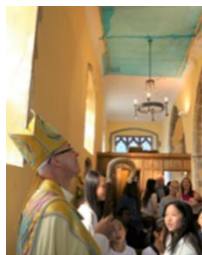
The Archbishop inspects the ceiling in 2017.

At the end of June, we finally signed off the National Lottery Heritage Fund Project. This had begun in 2017 when the Quinquennial Inspection had identified the need for major repairs to Sturry Church. With funding from the NLHF, donations from individuals, fundraising activities and volunteers time valued at £27,000, we delivered a £317,000 project. Along the way we had COVID lockdowns, a liquidated main contractor and three church treasurers. However, the building was repaired, kitchen facilities were improved and we became able to share the building and its heritage with the wider community.