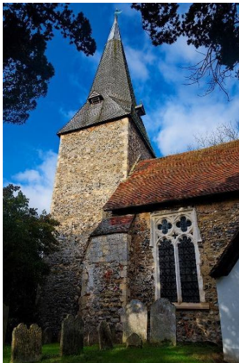
St Mary Fordwich