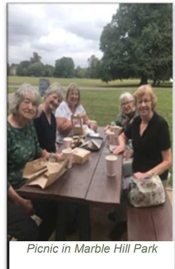
Picnic in Marble Hill Park

Do come and join us, you will know everyone.