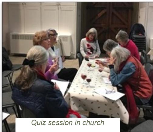
Quiz session in church