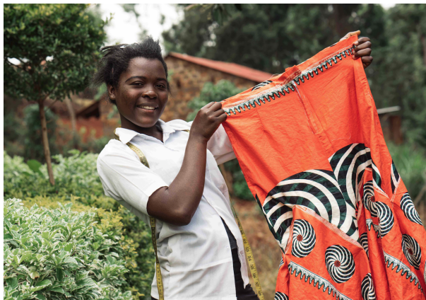
Photo: Seed of Hope Fashion Design student

The Trustees of Raising Futures Kenya confirm that they have complied with the duty contained within the Charities Act 2011 to have due regard to the Charity Commission's general guidance on public benefit. Our Chairman's report details how we have delivered our purposes for public benefit.