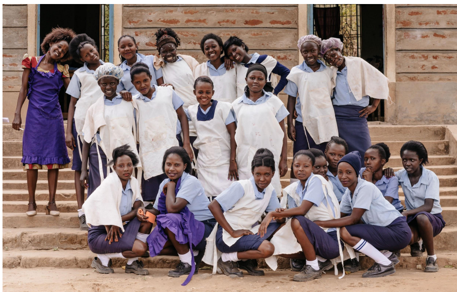
Photo: Students at Seed of Hope Kitui