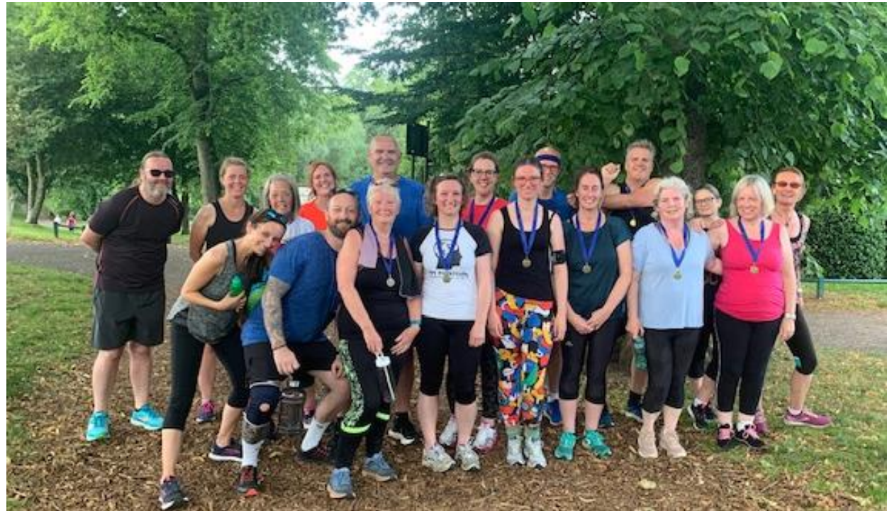
Image: Couch to 5k graduates

The trustees are pleased to present their Annual Report and Accounts for the year ended 31 December 2023