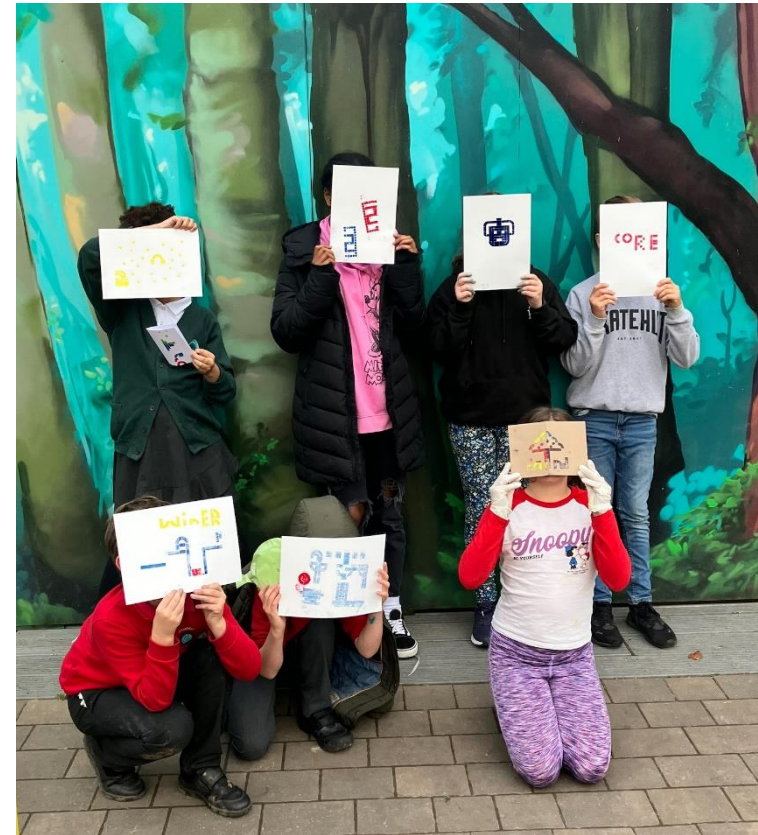
Image: Cotteridge Park Youth Club's Lego Printing Workshop

And our friends at Birmingham City Council, Birmingham Open Spaces Forum & Birmingham Community Matters